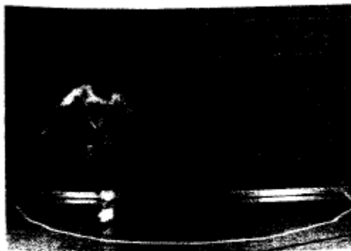
FIGURE 2. Carioca test. The athlete moves laterally using an alternating cross-over step.

There was a lack of any strong correlation between the involved extremity physical characteristics and the functional tests (Table 3). The highest correlations were observed between the shuttle run test and several involved extremity measurements, including knee extension (quadriceps) peak torque at 60 ( r = -.42, p < .05 ) and 270 °/sec ( r = -.41, p < .05 ), knee extension TAE at 270 °/sec ( r = -.38, p < .05 ), and knee flexion (hamstrings) TAE at 270 °/sec ( r = -.34, p < .05 ). Other significant correlations were observed between involved extremity knee (hamstring) flexion TAE at 270 °/sec and the shuttle run ( r = -.42, p < .05 ), the cocontractions test ( r = -.33, p < .05 ), and the total FPT ( r = -.32, p < .05 ). Finally the IAKS correlated significantly with the total FPT ( r = -.49 ). No significant correlations were observed between any of the functional tests and any of the bilateral deficits (Table 4).