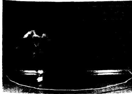
FIGURE 2. Carioca test. The athlete moves laterally using an alternating cross-over step.