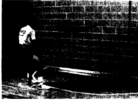
FIGURE 1. Cocontraction test. The athlete moves in a side-step or shuffle fashion around the periphery of the semicircle.

The carioca test (Figure 2) required the subjects to move laterally with a cross-over step. The test was performed over two lengths of a 12m distance. The subject began moving from left to right and reversed direction following the first 12-m length, thus performing the test moving a total of 24.5 m in the minimum amount of time possible.